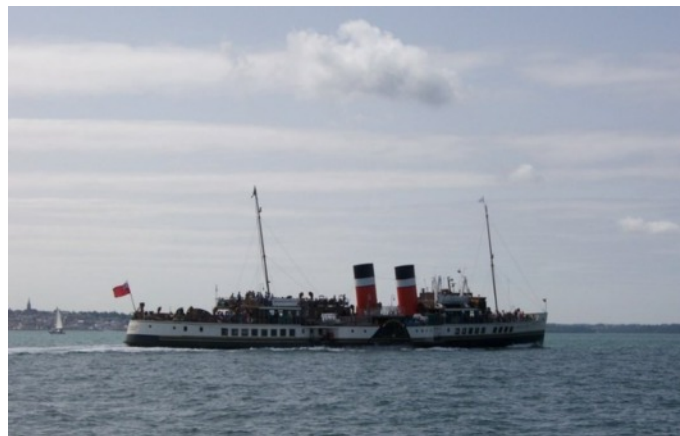
The Waverley in the Solent.