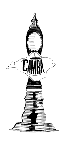
IW Branch CAMRA