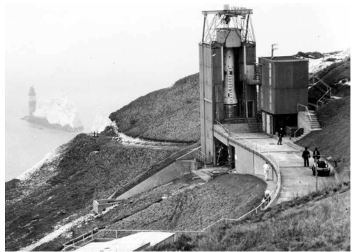
The Black Arrow launch vehicle undergoing static tests at the High Town test facility in the 1960s.